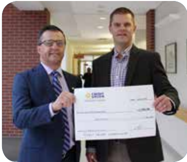
STEWART MEMORIAL HOME | FOYER STEWART MEMORIAL