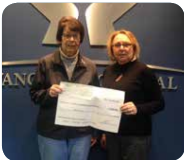
QEH FOUNDATION | FONDATION DE L'HÔPITAL QUEEN ELIZABETH