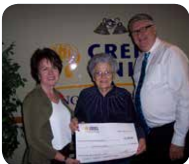
O'LEARY COMMUNITY HOSPITAL FOUNDATION | FONDATION DE L'HÔPITAL COMMUNAUTAIRE D'O'LEARY